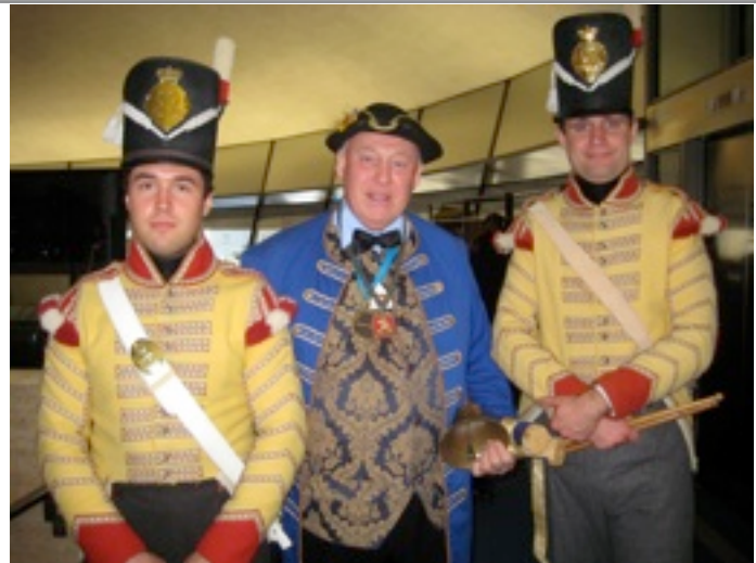
Fort York Guardsmen flank a town crier at the press conference announcing Toronto's plans for 2012 and '13.

More information can be found at toronto.ca/1812 ."