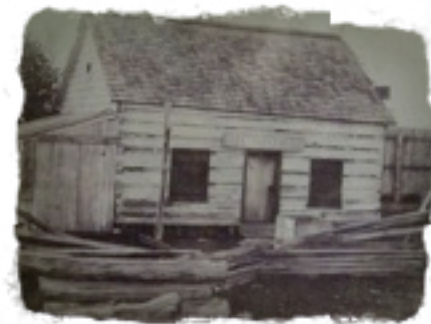
Right: Scadding Cabin when it was still called the Simcoe Cabin c. 1895