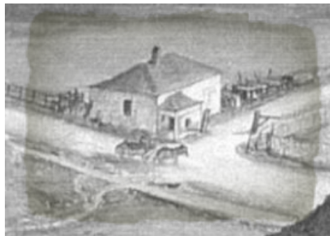
Above: from a painting of the Tollkeeper's Cottage when it sat at the crossroads of Bathurst & Davenport on the southeast corner.

Join your fellow Pioneers to vote on a new Board for 2012, enjoy refreshments and view a short video (a Structures episode) on the history of Christie Street.