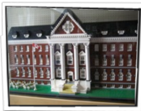
Left: Lego model of Pickering College, Newmarket ~ the college was one of our stops